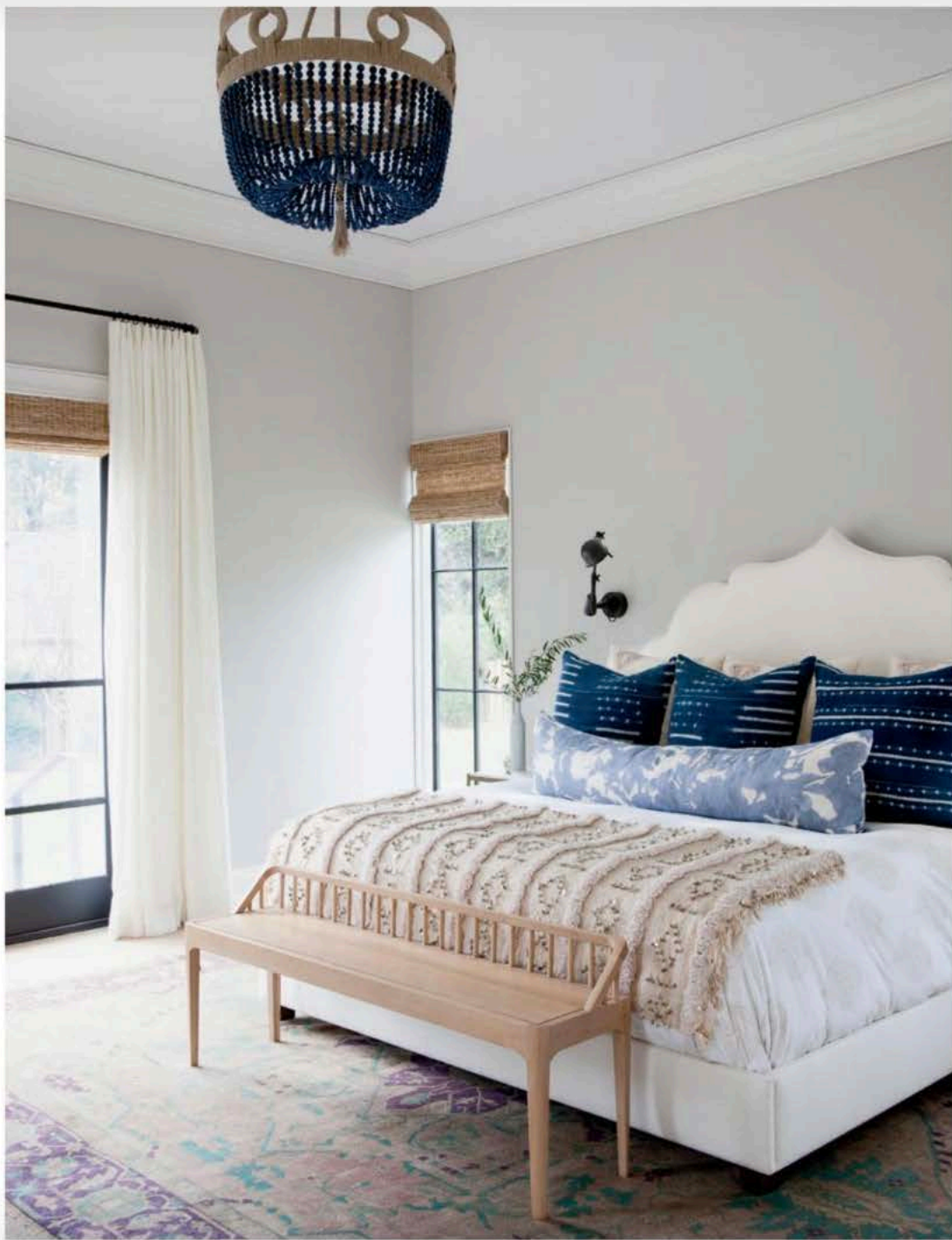
Opposite: A vintage rug from Nashville Rug Gallery sets the tone for the master suite. Ro Sham Beaux's Frankie Malibu chandelier converses with throw pillows made with mud cloth from Gamafro Originals. An oak spindle bench by Ethnicraft grounds the graceful silhouette of John Robshaw's Bihar bed, Ralph Lauren's '67 Boom Arm wall lamp for Circa Lighting lends a glow. Below: Calacatta Gold marble floors from Stone Source enrich the master bathroom with texture. Here, Crosswater London's Patinato Grande bathtub offers an indulgent retreat beneath custom mullioned windows by Peres Studios. The space's fresh aesthetic provided the perfect backdrop for a vintage rug.