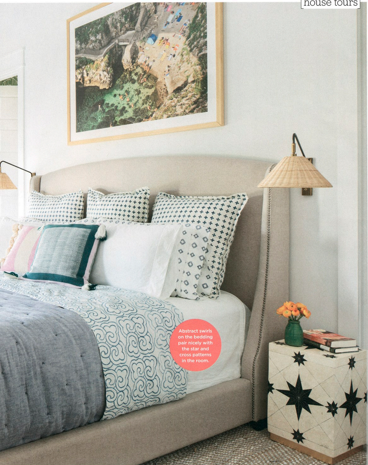
Abstract swirls on the bedding pair nicely with the star and cross patterns in the room.